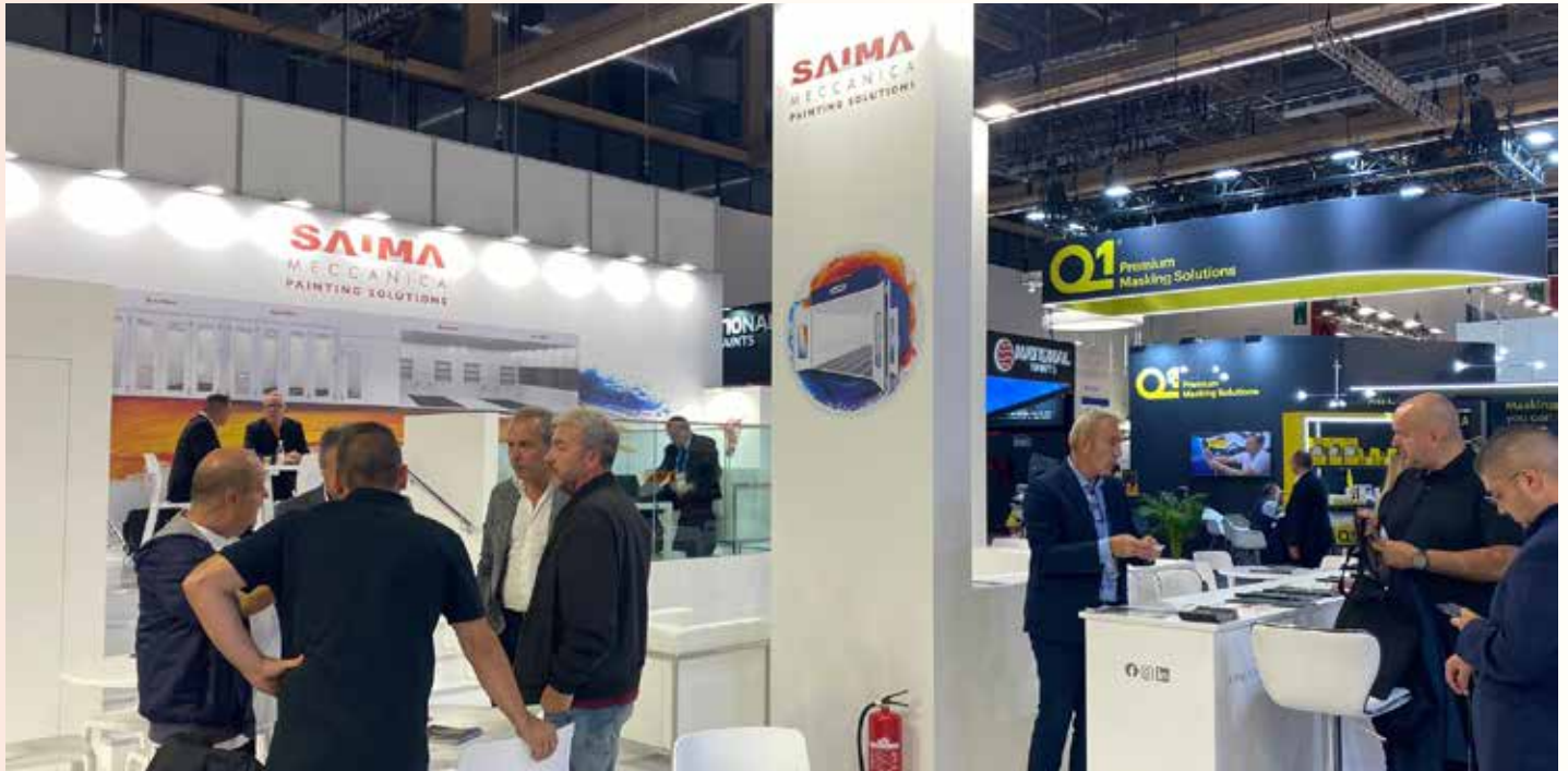
Photo: our stand in Frankfurt, an important meeting point for dealing with customers and importers which has been very successful.