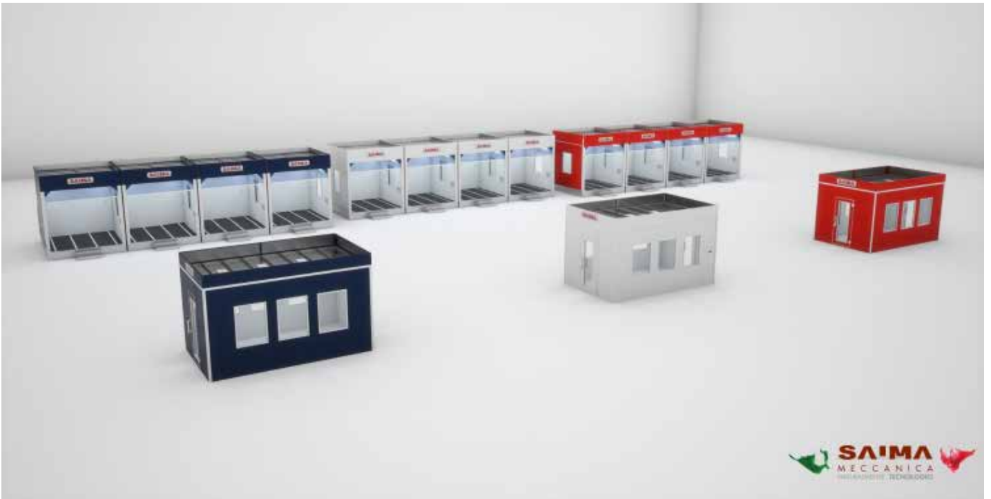
Photo: Saima mini-booths, displaying the colours of the host country (blue, white and red)

Our project was judged the best for professionalism, innovation and value for money. We supplied 12 mini paint booths and 3 Kleen boxes for paint preparation and we are one of the official sponsors as suppliers.