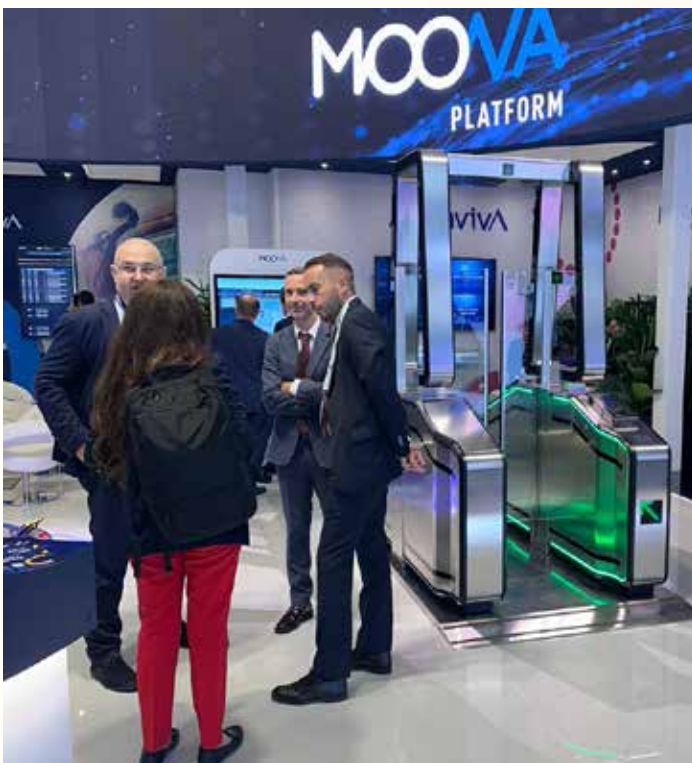
Photo: a scene from the trade show.

At Innotrans too, Saima Sicurezza, in collaboration with Al maviva's Moova platform, presents its models specifically designed for the transport sector.