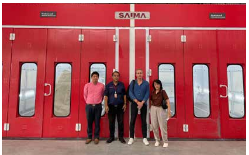
SAIMA installation in an official ISUZU workshop