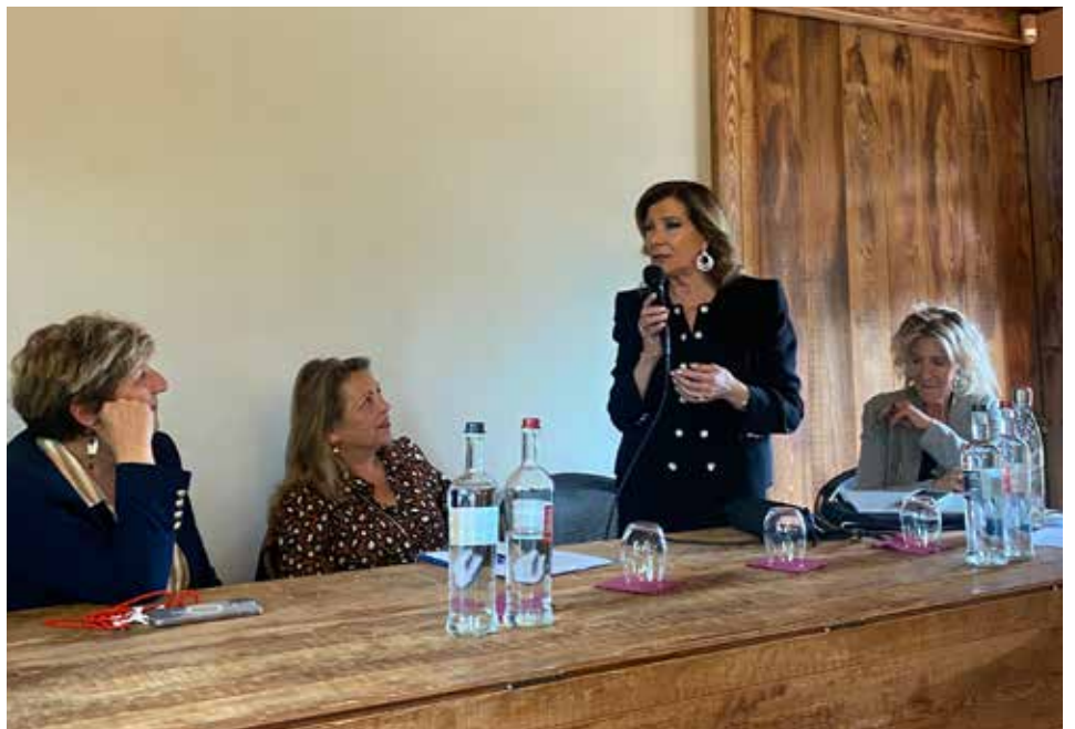
Pictured: with Minister Casellati in Florence.

A warm applause closed the very successful meeting, moderated with professionalism and style by La Nazione journalist Olga Mugnaini.